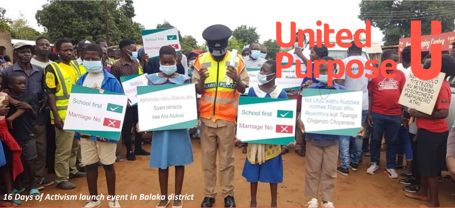
16 Days of Activism launch event in Balaka district