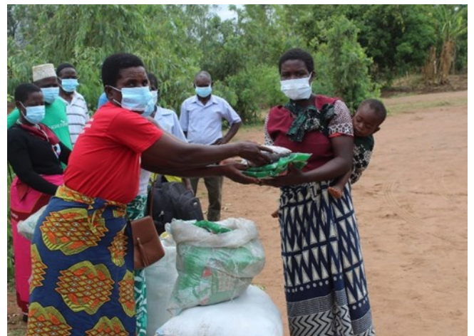
Farm Inputs Distribution at Mthiramanja Court in Mulanje District