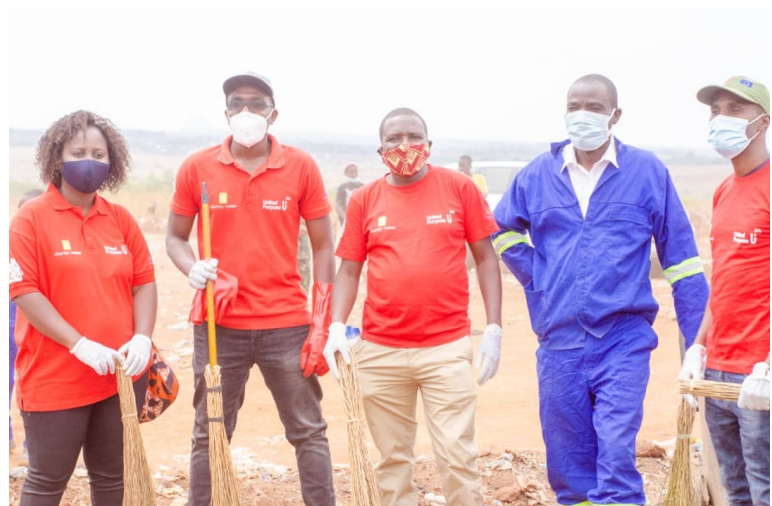
UP Team at National Launch at Chinsapo Grounds, 11th November

Environmental respect is one of UP's values. On 11th November, UP team members took part in the 2020 National Clean Up Day Launch.